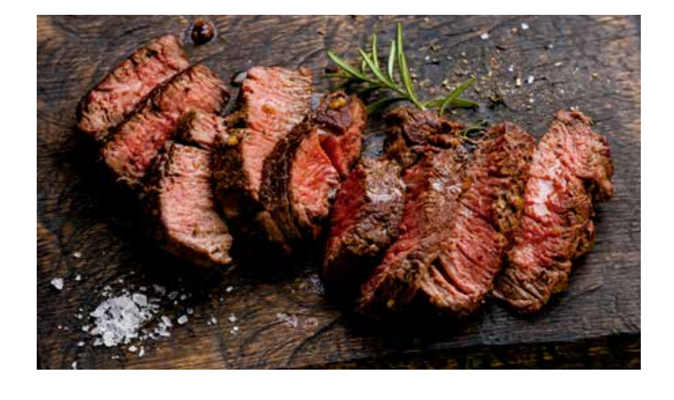
1st in the world beef consumption per cápita, arround the world.